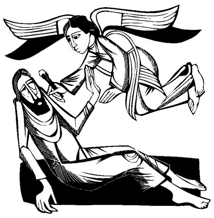
Then one of the seraphim flew to me, holding an ember that he had taken with tongs from the altar. He touched my mouth with it, and said, "See, now that this has touched your lips, your wickedness is removed, your sin purged." Then I heard the voice of the Lord saying, "Whom shall I send? Who will go for us?" "Here I am," I said; "send me!".

+ Fifth Sunday of the Year + February 9, 2025 5:30 pm (Saturday) 9:00 am and 11:00 am