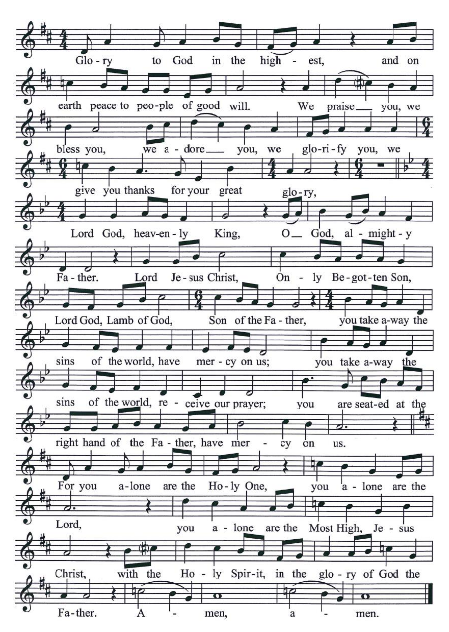
Mass of Saints Peter and Paul

NORMAN GOUIN, COPYRIGHT: © 2011 BIRNAMWOOD PUBLICATIONS (ASCAP) USED UNDER ONELICENSE.NET, #A-701-294.