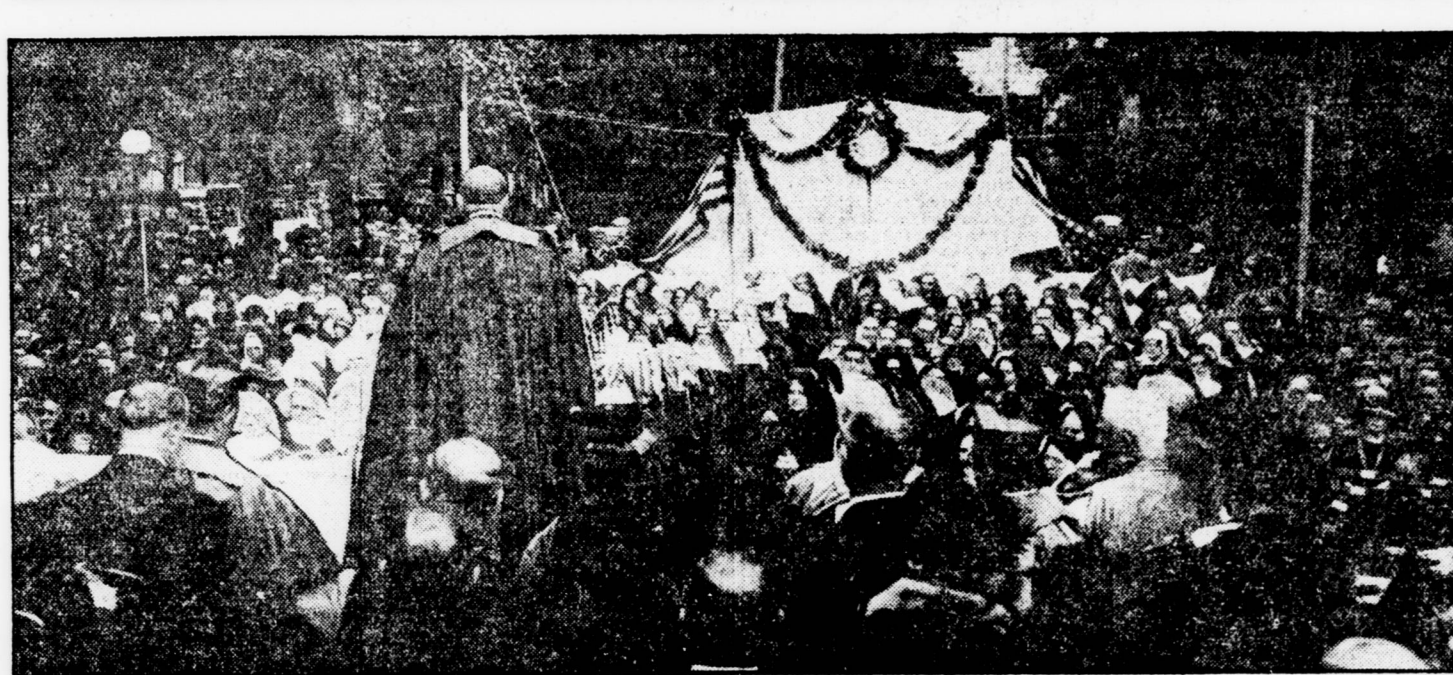
Upper—Photograph made yesterday when His Eminence, William Cardinal O'Connell placed a wreath on the tomb of George Washington at Mount Vernon. Lower picture portrays His Eminence, Cardinal O'Connell making address at the ceremonies attending the unveiling of the monument to the memory of the nuns of the battlefield, at Rhode Island avenue and M street northwest.